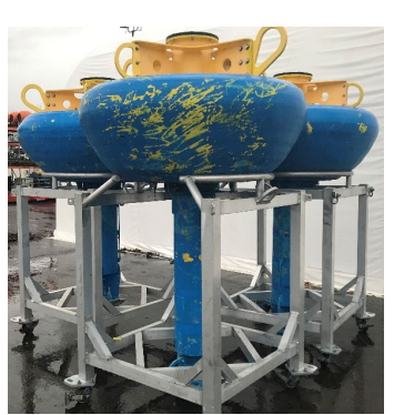
Figure 2: Submersible buoy. 3 per turn, 6' tall