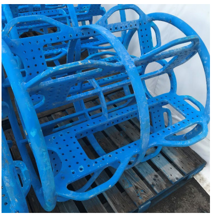
Figure 3: Near-surface Instrument Frames. 6 per turn. 3' diameter x 3' tall.