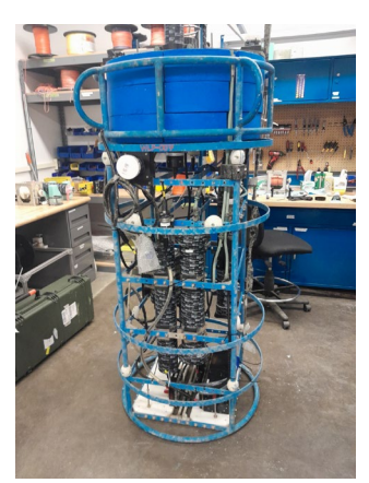
Figure 8: WLP-007 "coastal surface piercing profiler" 6 total to repaint 1 time a year, as needed.

b. Additional services scheduled throughout the Contract Term as needed and as agreed to in advance between OSU and Contractor. Additional services will include, but not be limited to, patching epoxy paint, painting smaller platforms with antifouling paint, and repairs to aluminum maritime equipment. Contractor will adhere to regulations and best practices for worker and environmental protection. Example of equipment for additional services in Figure 8.