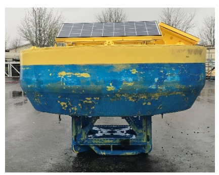
Figure 1:Coastal Surface Mooring (CSM). 4 per turn. Foam disc is 10' diameter, aluminum structure is \sim 2' . \sim 3000 \# as shown, buoys will be delivered without the shown solar panels. There is a 4'x4' interior space in the disc that needs painted.