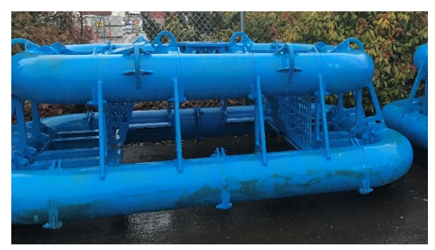
Figure 4: Multifunction Node (MFN). 2 per turn. ~2000# 8'x6'x3' tall.