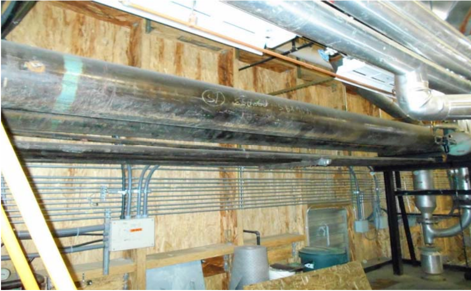
Press steam accumulator approximate shipping dimensions; 8' x 8' x 20', 10,500#