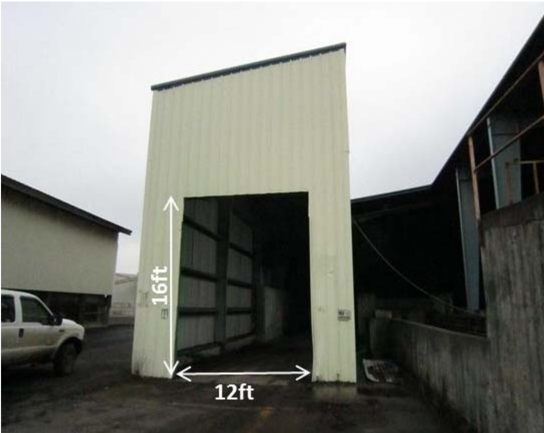
Actual width is 12'-2".