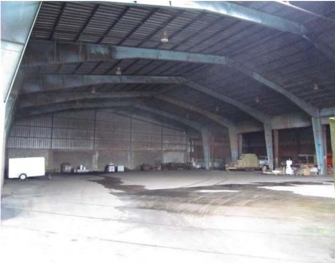
The warehouse is empty. Floor area is at least 120' x 100'.