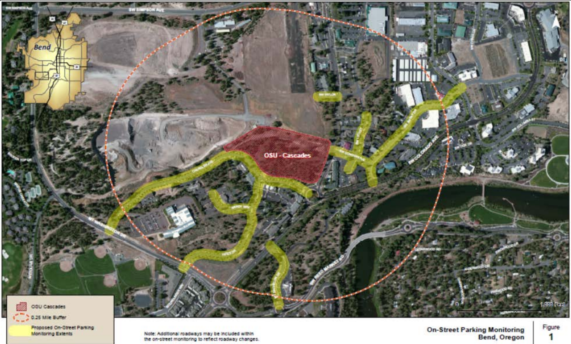
On-Street Parking Monitoring Bend, Oregon