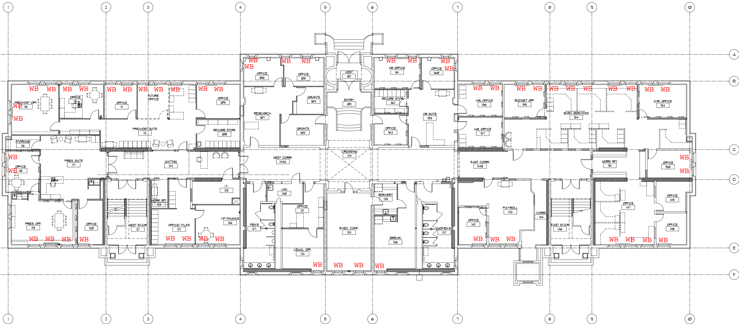
1 FIRST FLOOR PLAN - WEST SCALE: 1/8"=1'-0"